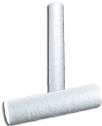
Figure 1 : Hytrex Depth Cartridge Filters