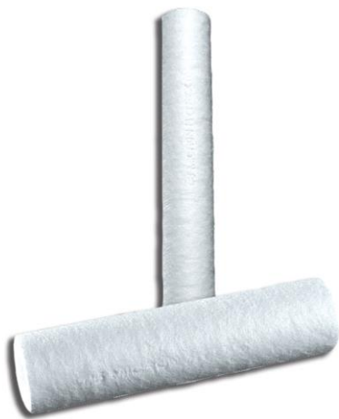
Figure 1: Purtrex Depth Cartridge Filters